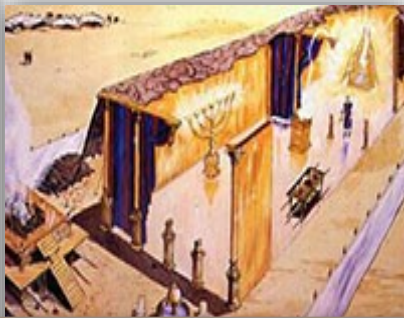
Earthly sanctuary built by Moses Exodus 25 to 40

Answer: In the Sanctuary — Hebrews 8:1, 2.