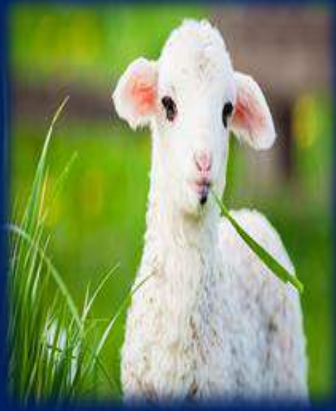
The Firstborn: The Lamb of God

“Giving thanks unto the Father, which hath made us meet to be partakers of the inheritance of the saints in light: Who hath delivered us from the power of darkness, and hath translated us into the kingdom of his dear Son: In whom we have redemption through his blood, even the forgiveness of sins: Who is the image of the invisible God, the firstborn of every creature: