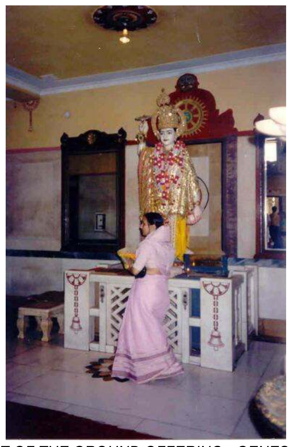
FRUIT OF THE GROUND OFFERING - GENESIS 4:3