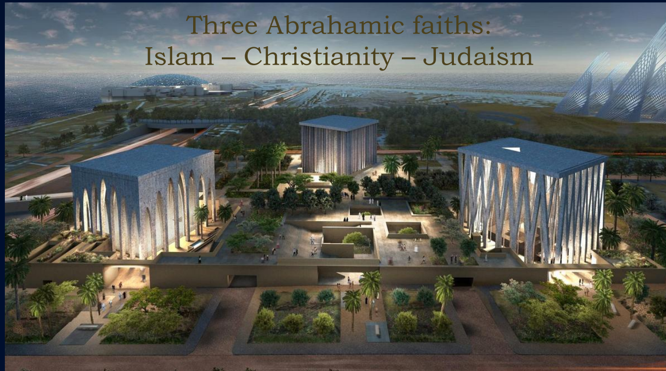
Three Abrahamic faiths: Islam – Christianity – Judaism

https://www.esquireme.com/news/53274-abu-dhabi-reveals-names-of-the-mosque-church-and-synagogue-in-its-abrahamic-family-house