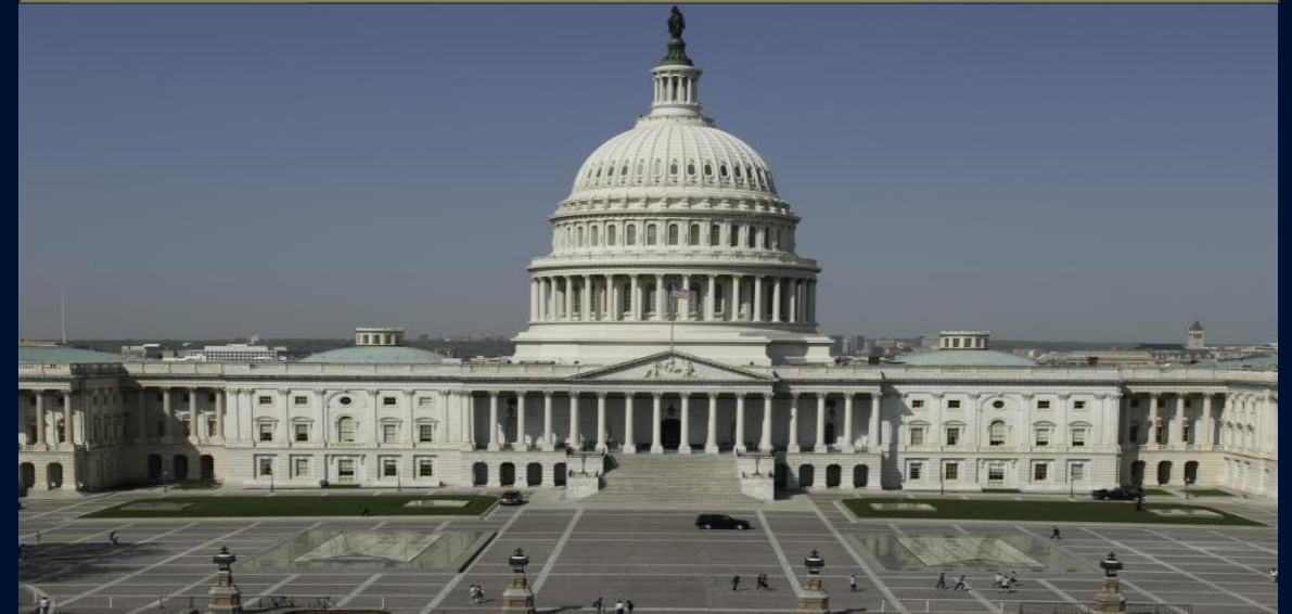
Capitol Hill – Washington D.C – USA

“While serving in 1793 as President George Washington's Secretary of State, Thomas Jefferson named Capitol Hill , invoking the famous Temple of Jupiter Optimus Maximus on the “Capitoline Hill”, one of the seven hills of Rome.”