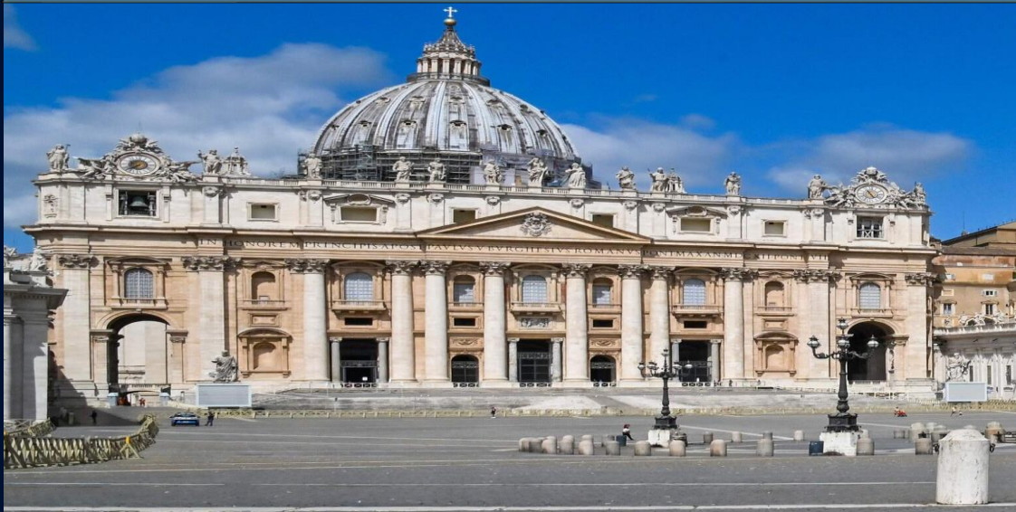
Vatican – Rome Italy – Europe

“The word "Vatican" literally means "Divining Serpent," and is derived from Vatis = Diviner and Can = Serpent. Vatican City and St. Peter's Basilica were built on the ancient pagan site called in Latin “Vaticanus mons” or “Vaticanus collis”, which means “hill or mountain” of prophecy.”