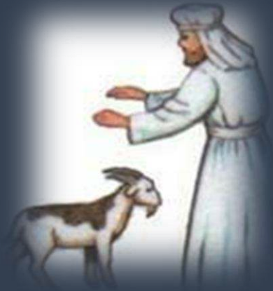
Fit Man Leviticus 16:21

“And I will put enmity between thee and the woman, and between thy seed and her seed; it shall bruise thy head, and thou shalt bruise his heel.” Genesis 3:15