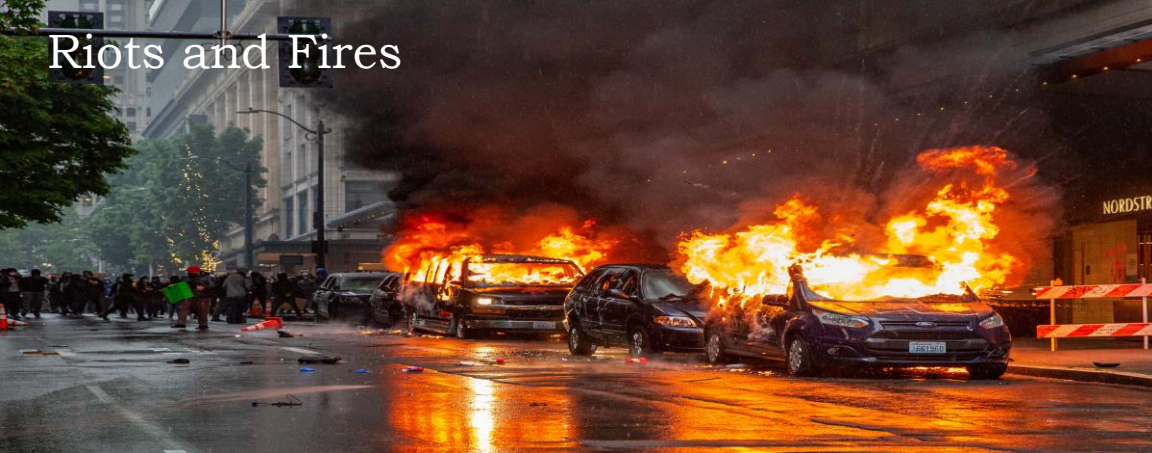
Riots and Fires

“The time of trouble—trouble such as was not since there was a nation [Daniel 12:1]—is right upon us, and we are like the sleeping virgins. We are to awake and ask the Lord Jesus to place underneath us His everlasting arms, and carry us through the time of trial before us.” Manuscript Releases 3:305, 1906.